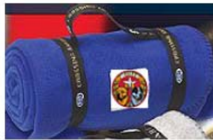
Fleecy Blanket With Logo $50

Total Number of Shirts: _____ Cost for this section: _____