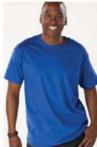
Hanes 100% cotton SHORT SLEEVE T $16