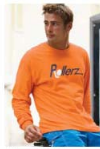
Hanes 100% cotton LONG SLEEVE T $25

NOTE: Prices above are for sizes Small through XL. Sizes 2X and 3X, add $2 per item. Size 4X, add $5 per item.